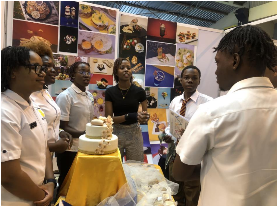
Students interact with a presenter during a culinary exhibition, showcasing creativity and practical learning.