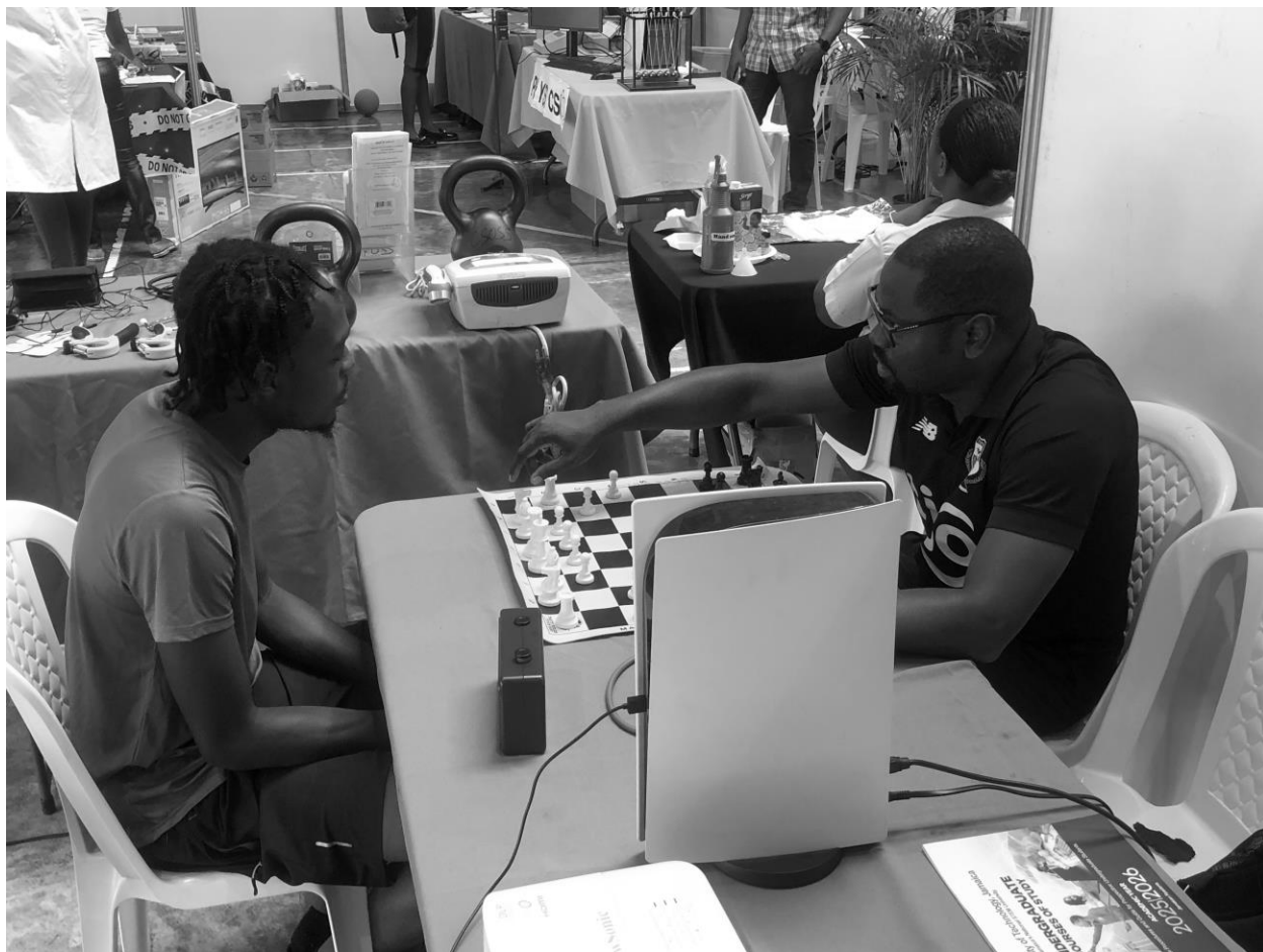
Two men engage in a chess match during a campus event at UTech Ja, demonstrating focus and shared intellectual exchange.