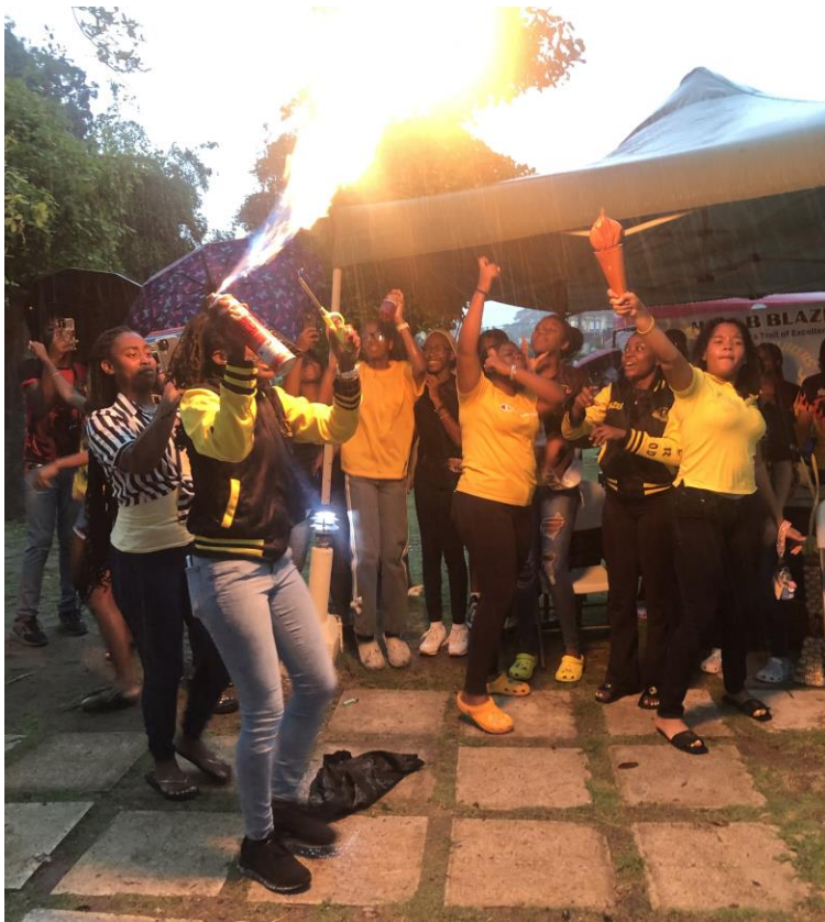
Students celebrate a campus event featuring a high-energy fire performance, creating a vibrant and electrifying atmosphere.