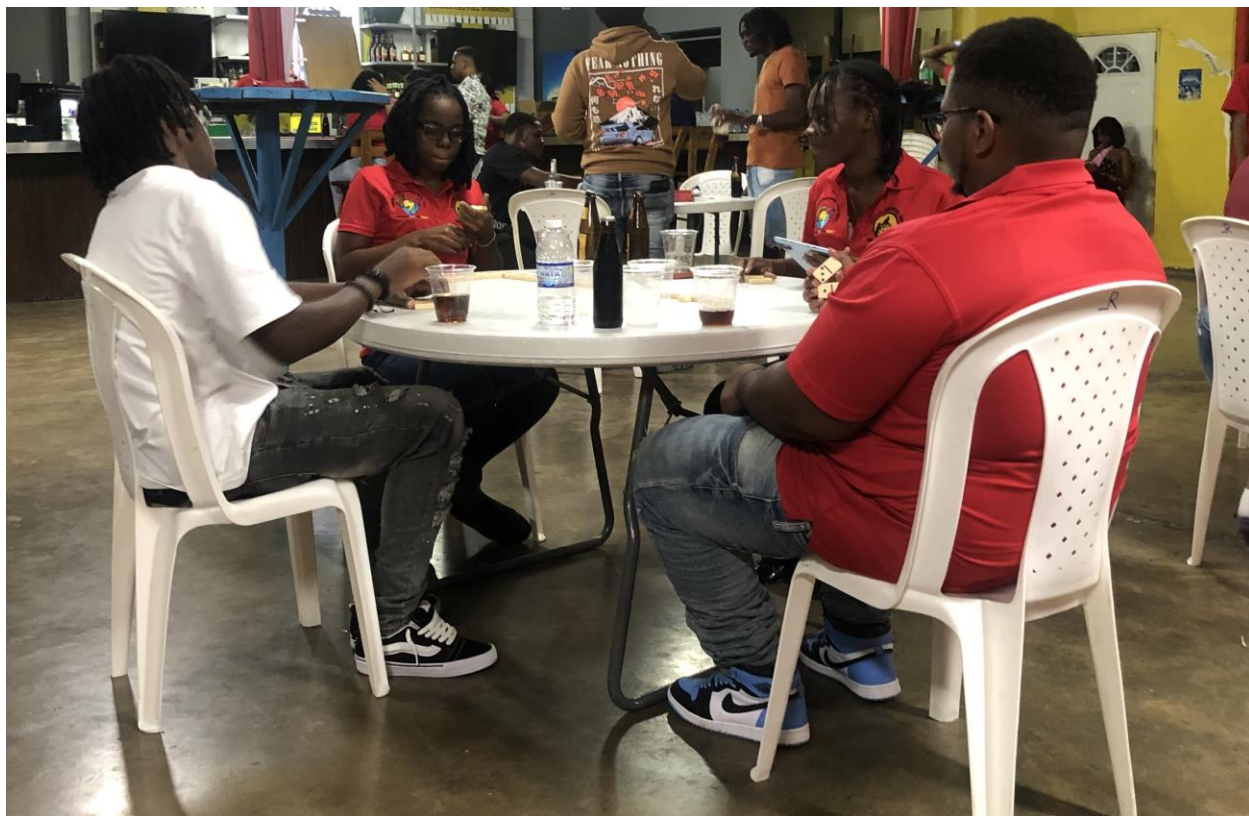
Friends gather at a local venue, sharing conversation in a relaxed social setting.