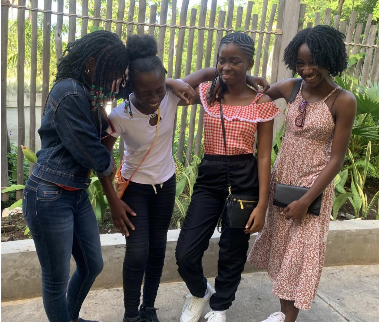
Friends share laughter during a casual outing, capturing a moment of youthful connection.