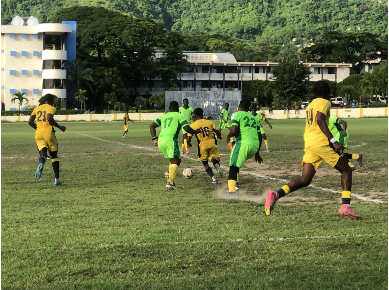
Players contest possession during a competitive football match as both teams battle for control.