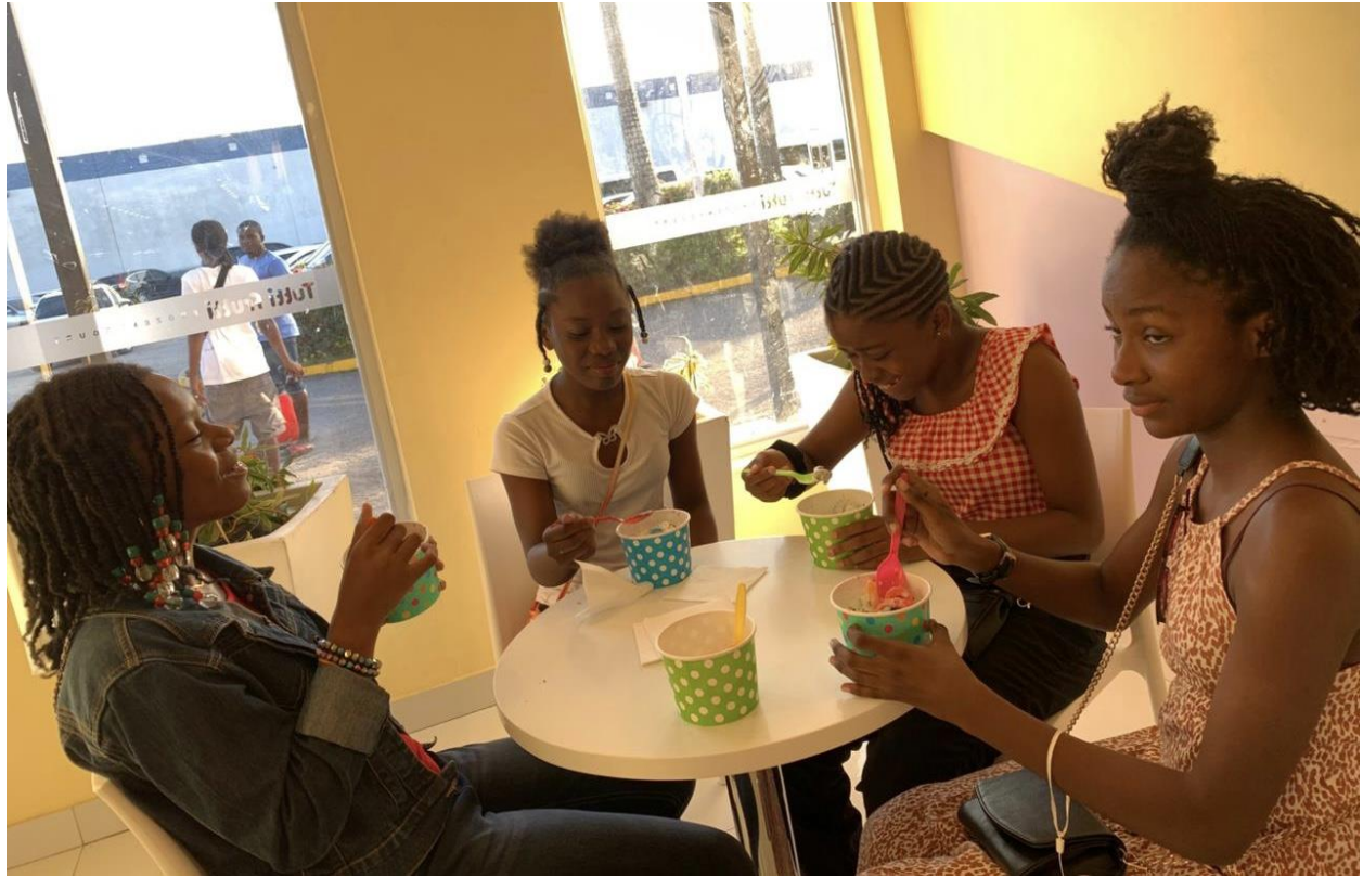
Friends enjoy ice cream together, reflecting simple moments of social bonding.