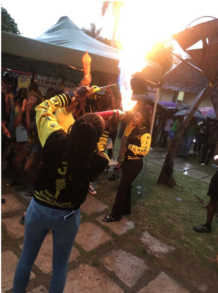
Attendees participate in a lively campus gathering, capturing the social atmosphere of the event.