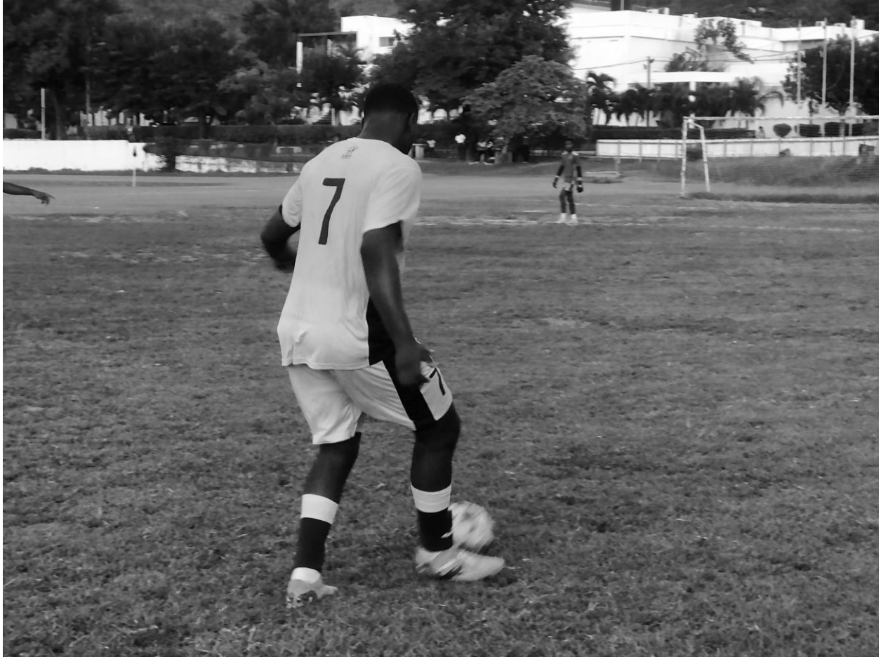
A footballer maintains control of the ball during open play, demonstrating focus and technical skill.